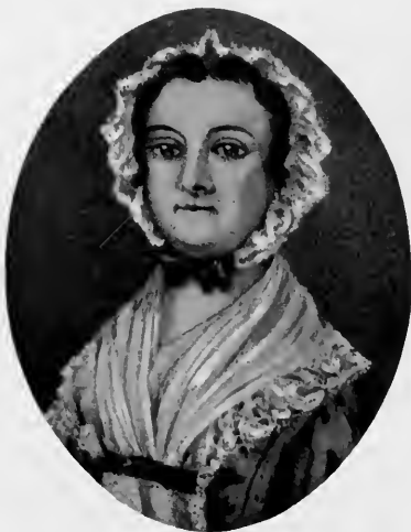
Mrs. Jacob Leisler Page 28